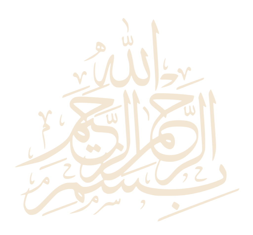
In the Name of Allah, the Most Gracious, the Most Merciful.